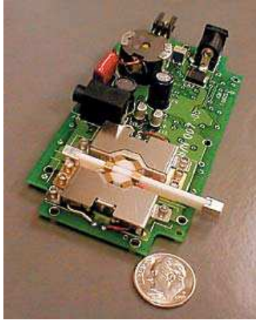
Figure 1: A piezo electric motor on a circuit board

solar cell arrays for this purpose. These arrays have been used in earlier implementations, both to power piezoelectric motors and to power MEMS devices (explained below)[Lee95]. However, in some cases the deployment environment may not favor solar power (for example, in caves). In such cases, two other technologies offer themselves as suitable alternatives. These are dry polymer electrolyte cells (Lithium-polymer cells) and Carbon-nanotube hydrogen storage fuel cells. Both these technologies have yet to be proven in the micro-scale domain (and the nanotube fuel cell is still in prototype stage) but they offer the promise of clean, long endurance, miniature batteries for microrobots. Thus, a choice between one of these two technologies and the solar cell array is made for the power source in the current design, depending on the environment of interest.